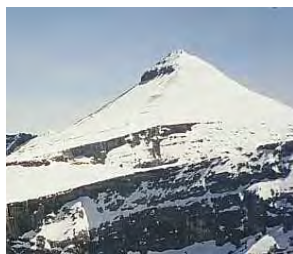
Banded Peak—Bragg Creek