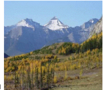
Banded Peak—Bragg Creek